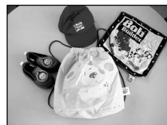
Ideal bag size for pre-school, not too big.

Old clothes are best for preschool as glue and paint have a habit of finding their way onto clothes. Please ensure all outdoor clothes, including boots, hats and gloves, are clearly named . We encourage children to wear hats in all weathers. Sun hats must be worn in the summer when in direct sun and parents should provide a bottle of sun cream (named) for staff to apply.